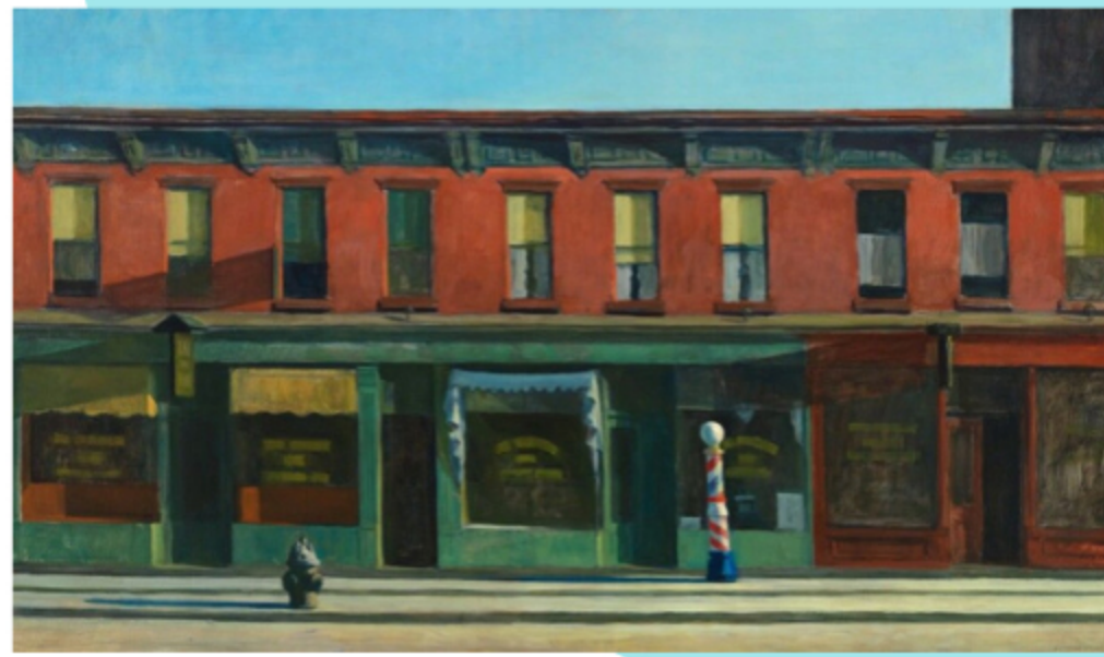
Early Sunday Morning, Edward Hopper