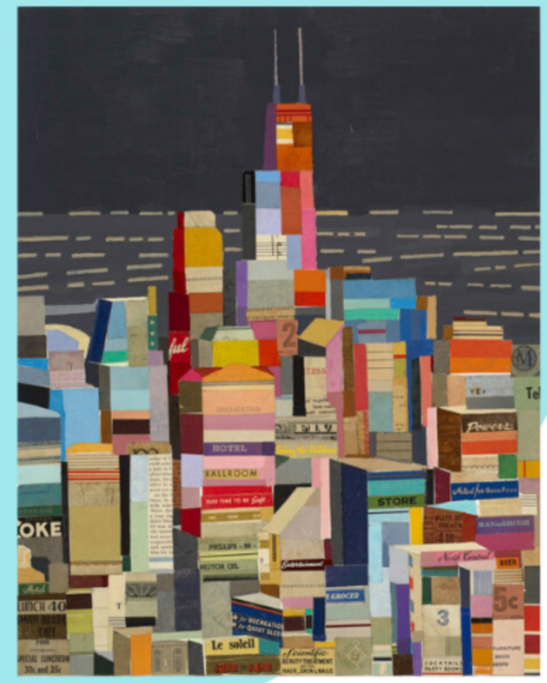
Cityscape Collage, Andy Burgess

In the book Last Stop on Market Street by Matt de la Peña, CJ and his Grandma ride the bus through the city on their way to the soup kitchen. What does your city look like? Does it look like Grandma and CJ's or different? We can make a CITYSCAPE , an artist's (that's you!) picture of a city. You can make a CITYSCAPE look like your view from your window, from a photograph or picture or, from your imagination.